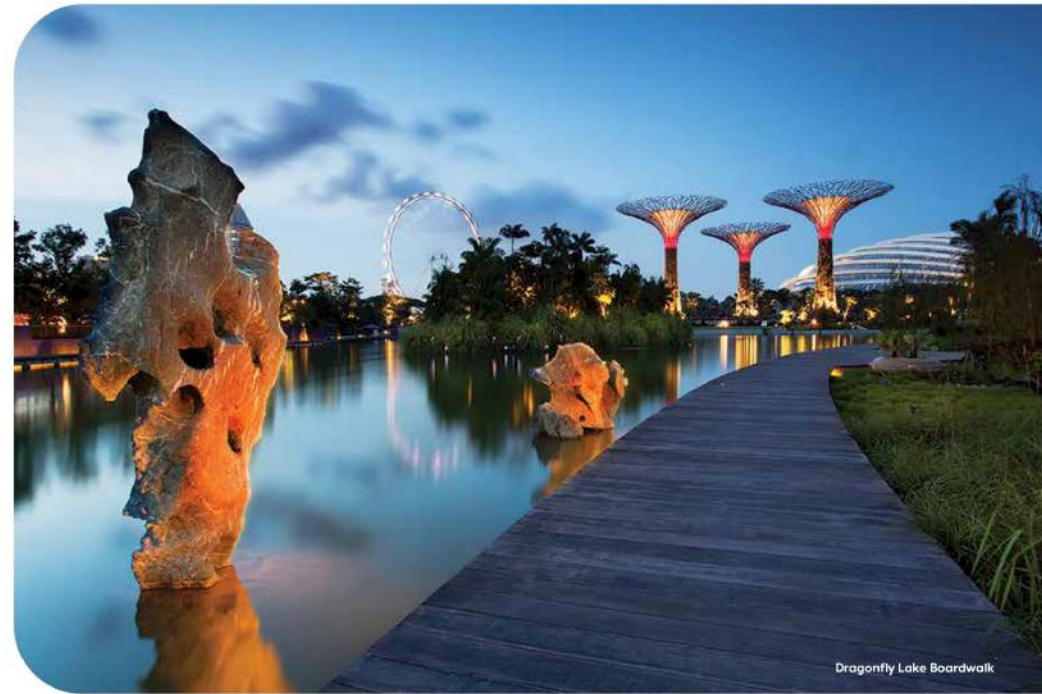
Dragonfly Lake Boardwalk