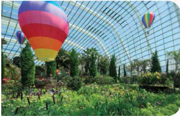
Flight of Fancy