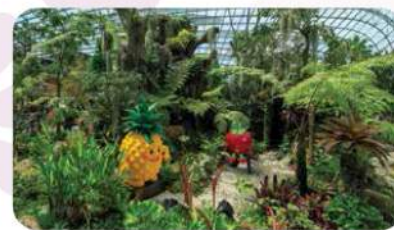
Christmas Sugar Mountain