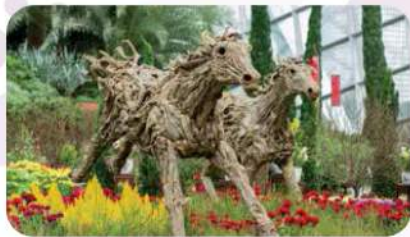
Year of the Horse