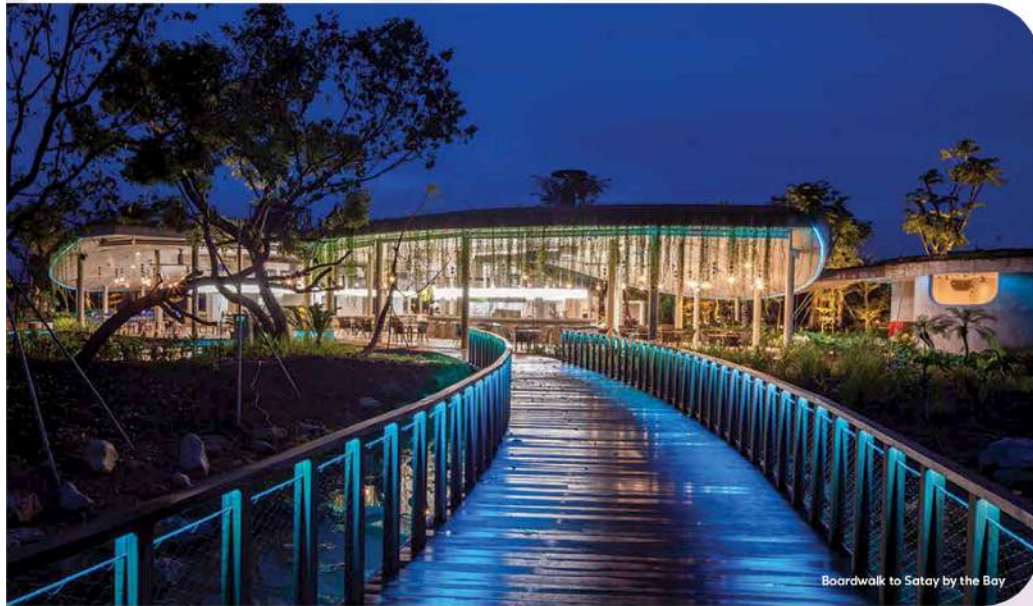
Boardwalk to Satay by the Bay

You're never more than a few steps away from great food at the Gardens. Savour gourmet dining as well as authentic local fare at our restaurants.