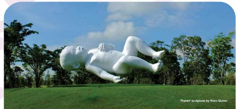
'Planet' sculpture by Marc Quinn