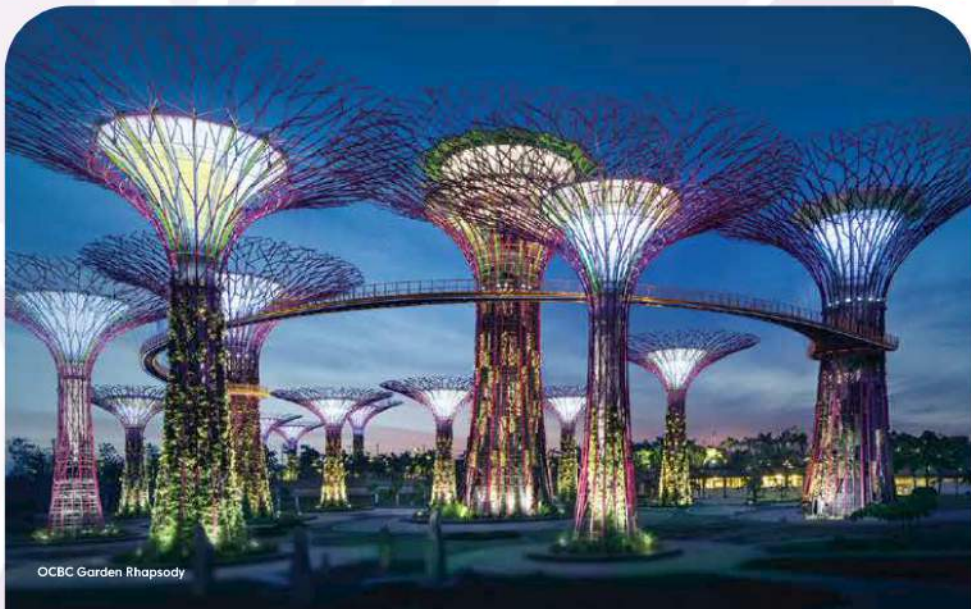
OCBC Garden Rhapsody

Treat yourself to our free light and sound show at 7:45pm and 8:45pm daily. Awaken your senses with this exhilarating visual and audio effects spectacle.