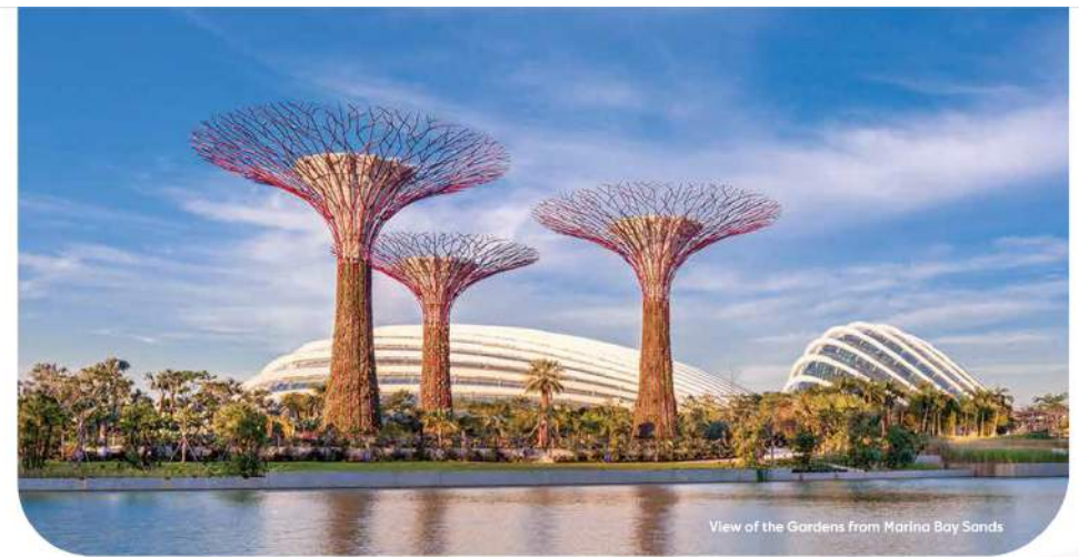
View of the Gardens from Marina Bay Sands