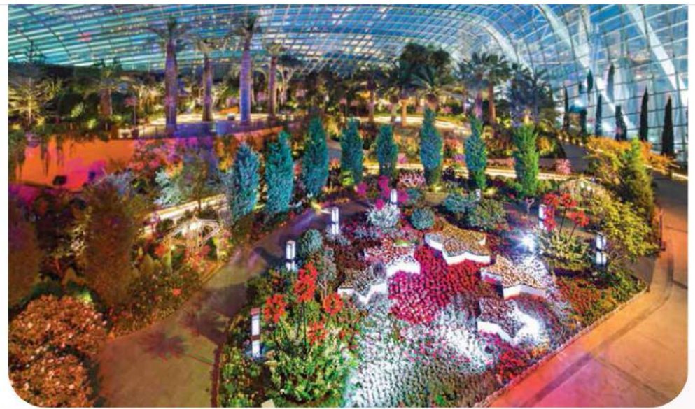
National Day and Hari Raya