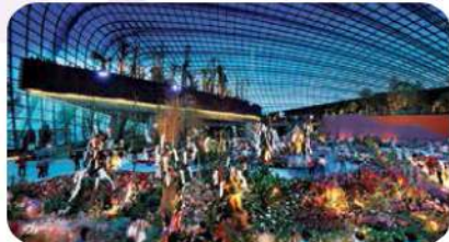
Flower Field Nightscape

Stop and smell the flowers in the colourful changing displays of the Flower Field, which reflects different seasons, festivals and themes.