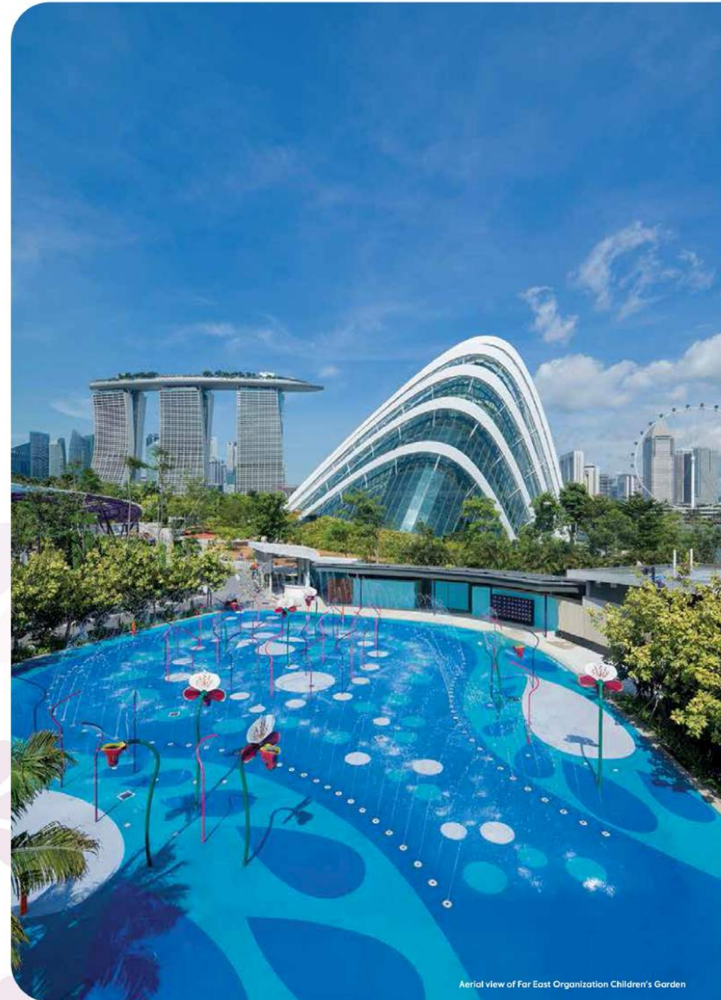
Aerial view of Far East Organization Children's Garden

Discover the world of plants from the Treehouses and test your skills at crossing our suspended bridge.