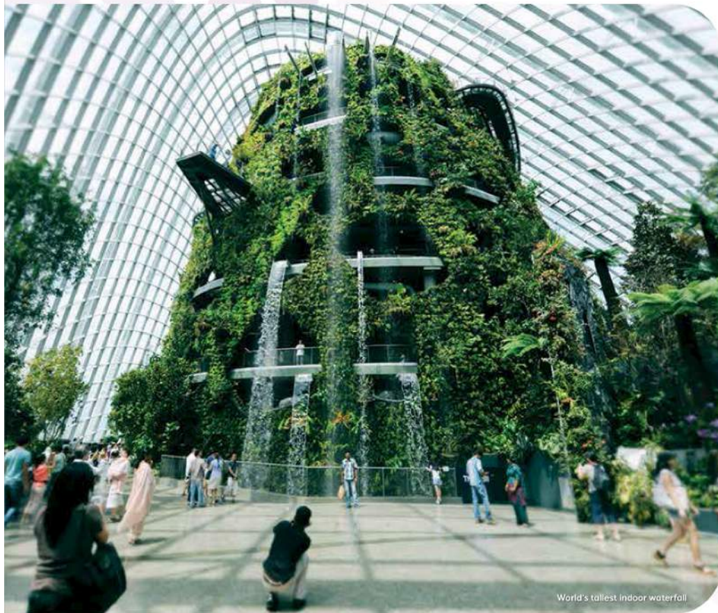
World's tallest indoor waterfall

Go on a trek behind the waterfall and enjoy the refreshing cool air and majestic views of the waterfall below.