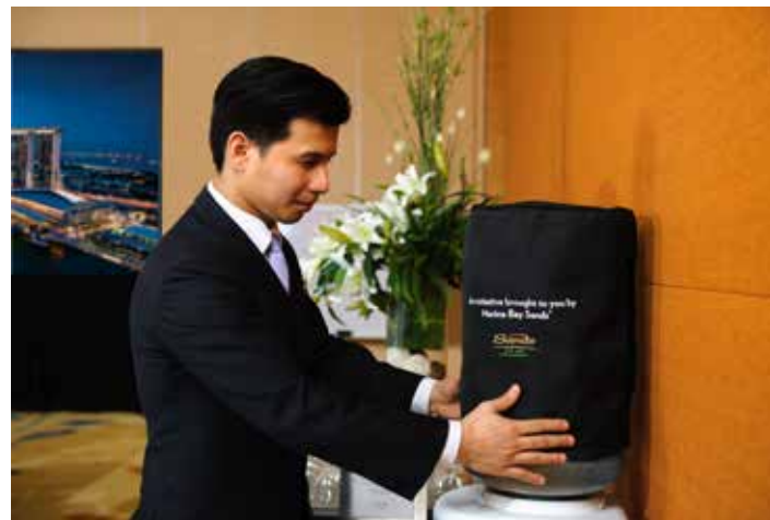
Green Meetings Concierge

They will be your dedicated guide and assist you throughout the entire event planning process!