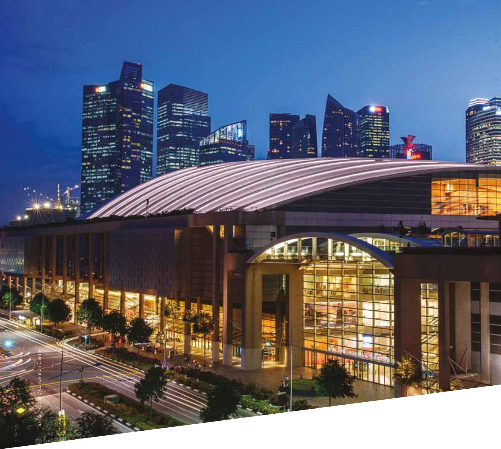
Sands Expo and Convention Centre