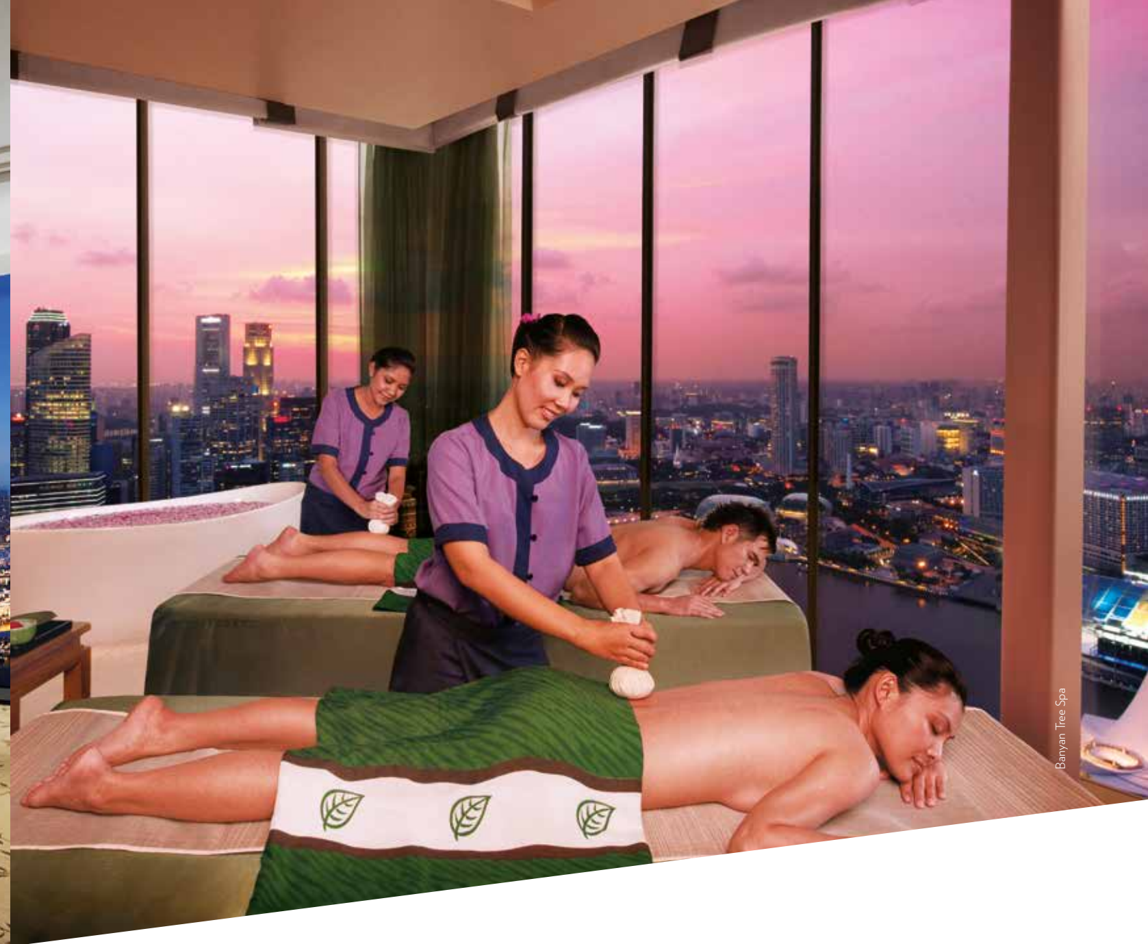
Banyan Tree Spa