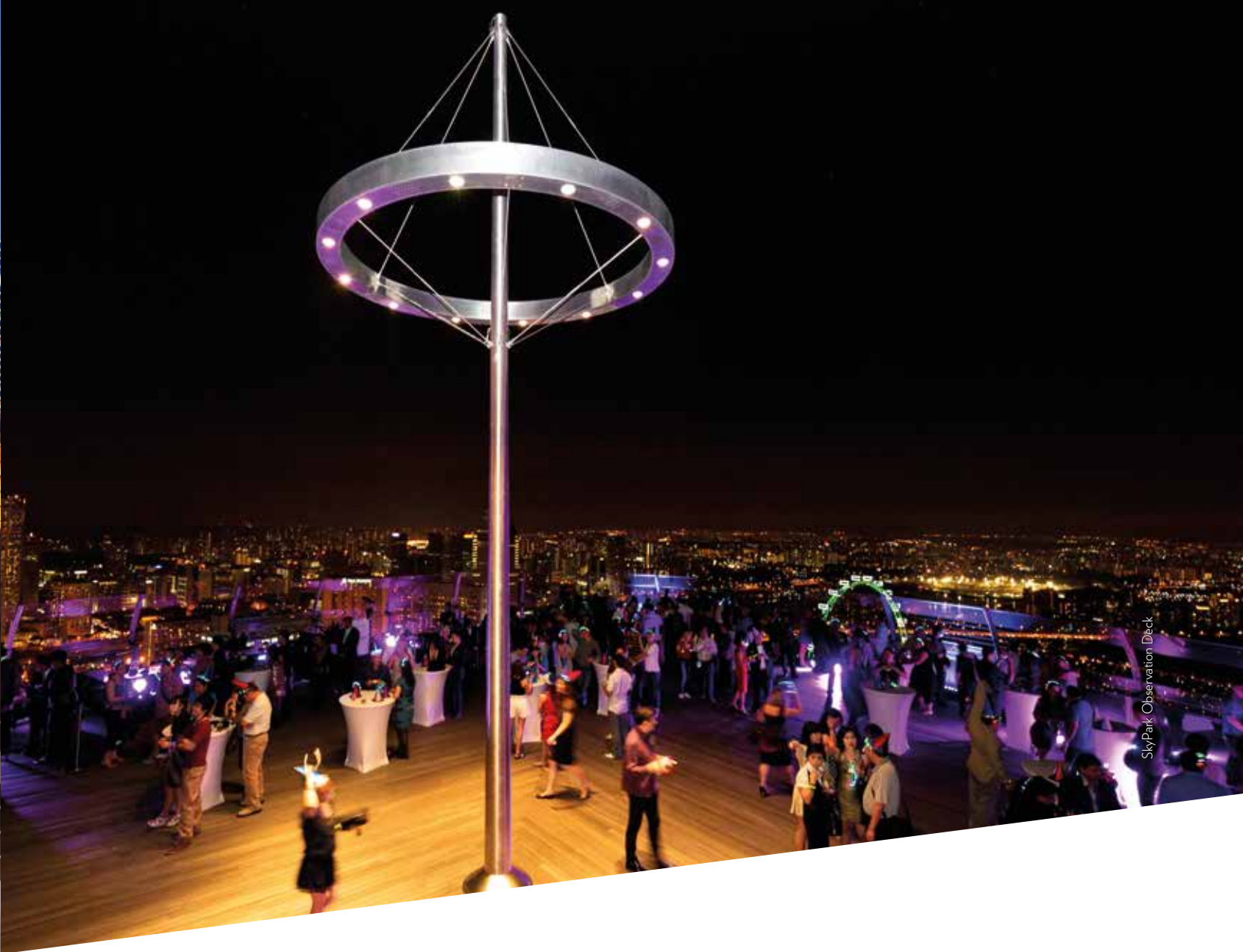
SkyPark Observation Deck