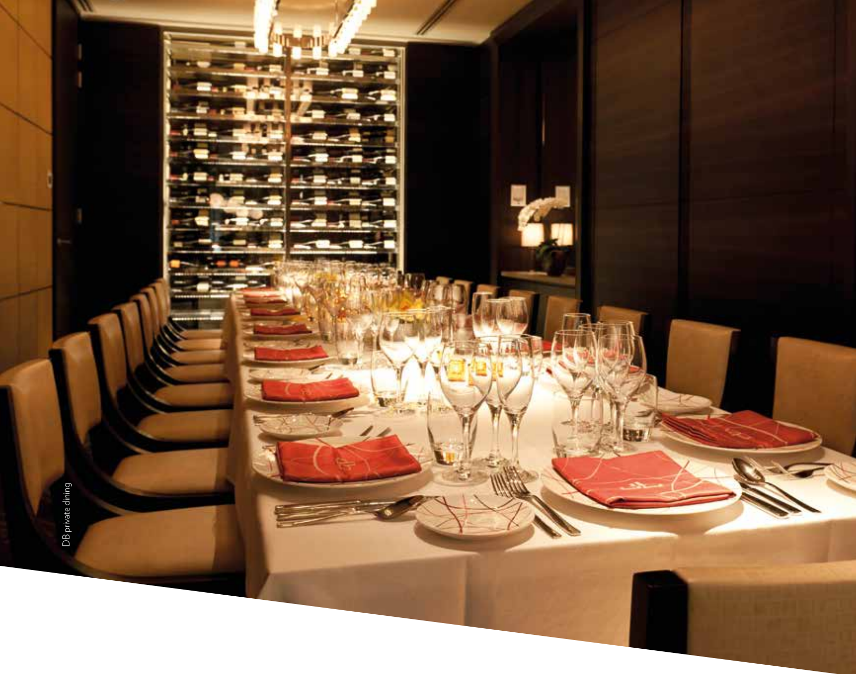
DB private dining